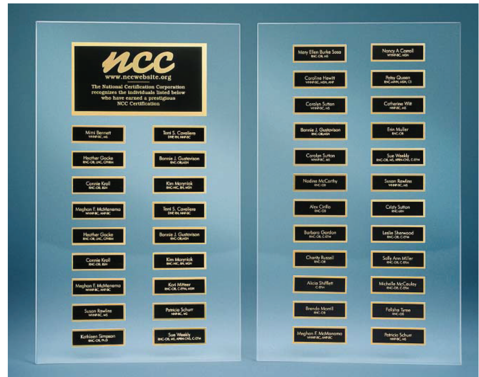
Plaque with Header & Names

The National Certification Corporation recognizes the individuals listed below who have earned a prestigious NCC Certification